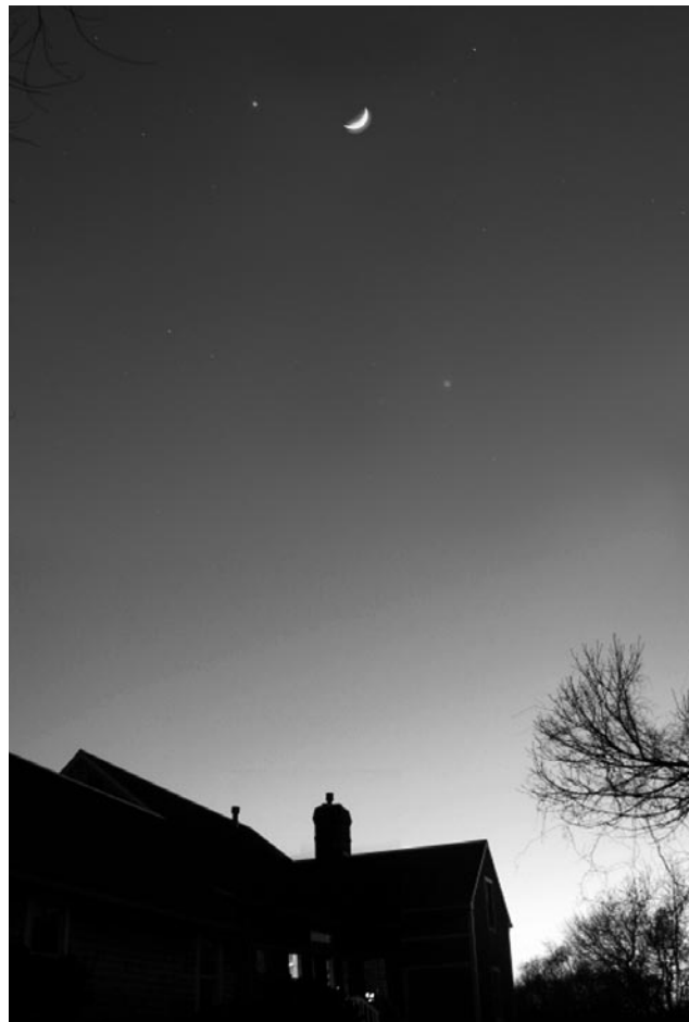
Western sky at dusk, February 26, 2012

When a group of hockey players who use the Ponderosa asked that this organization consider an upgrade to the