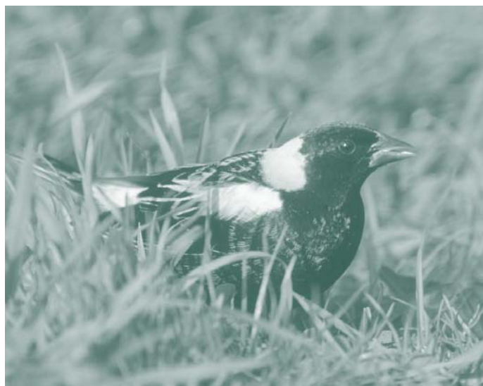
Bobolink photo by Geoff Dennis.

Bobolinks are drawn to habitat that includes wetlands where they can withdraw to molt in mid-August before they begin their long migration to South America for the winter. Bird behavior is not only fun to watch but has much to teach us about the value of our meadows and wetlands. Learning how to balance our needs with those of the wildlife that share our landscape is fundamental to SPA's stewardship and educational work in the community.